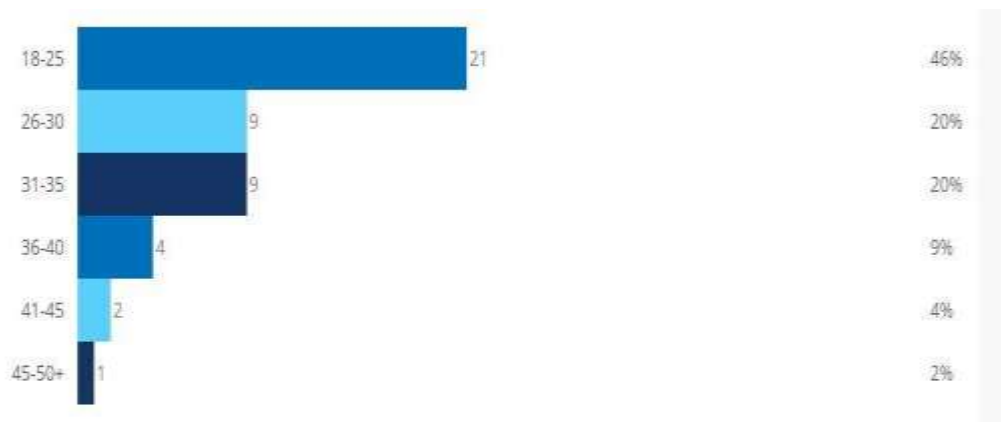
Figure 4. Teacher Age Ranges

A total of 37 U-Group members responded to the survey on education majors. Figure 3 shows a variety of educational pursuits including business (6), education (2), communication (5), hotel & restaurant management (3), nursing (6), psychology (4), and others (11).