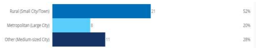
Figure 5. Teacher City Backgrounds

A total of 46 U-Group members responded to the survey on age ranges. Figure 4 shows that the majority of teachers are between the ages of 18-25 (21), while others represent the ages of 26-30 (9), 31-35 (9), 36-40 (4), 41-45 (2), and 50+ (1).