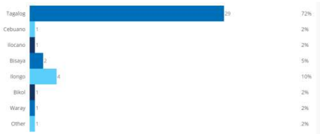
Figure 1. Teacher Ethnic Backgrounds

A total of 40 U-Group members responded to the survey on ethnic backgrounds. Figure 1 shows that the majority of teachers (29) are from a Tagalog ethnic background which encompasses the area of Luzon. Cebuano, Ilocano, Bikol, Waray, and Other backgrounds are represented, but minimally (1), while Bisaya and Ilongo are represented at somewhat higher levels: (2) and (4) respectively.